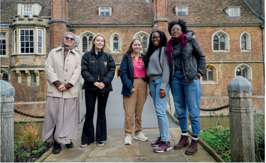
The 2022 cohort of Alexander Crummell Scholars