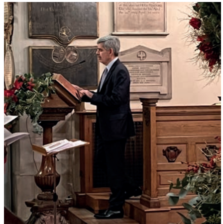
Dr Mohamed El-Erian giving a reading at the 2022 Alumni Carol Service