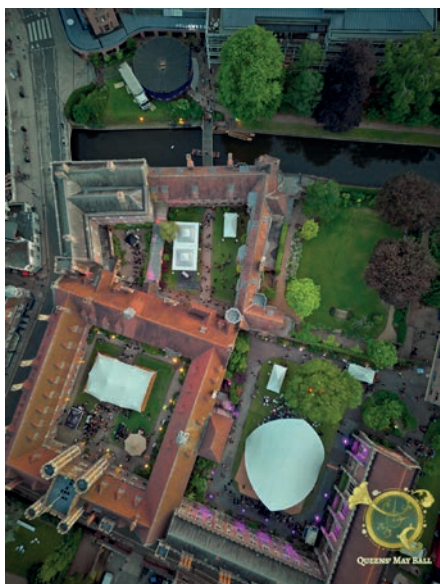
Queens' May Ball returned in 2023 after a hiatus due to Covid-19