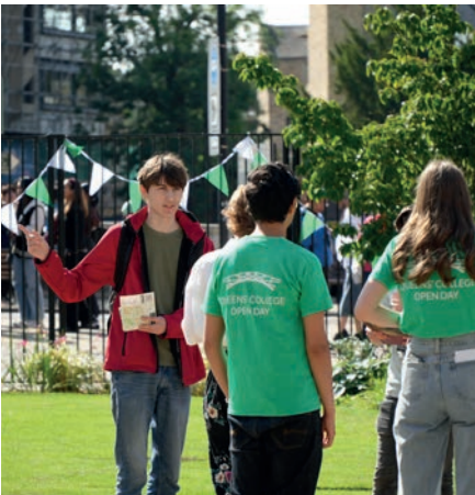
The College Open Day in July 2023