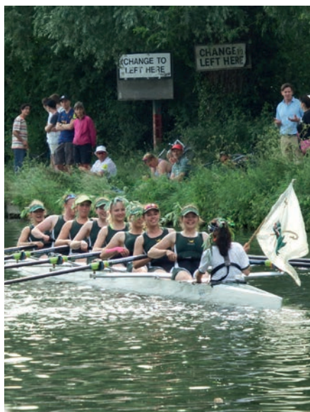
W1 won blades in May Bumps 2023, having last done so in 1992