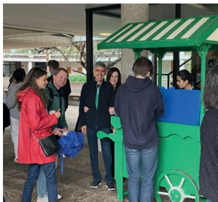
Ice creams being served on the Round to celebrate the Coronation of King Charles III