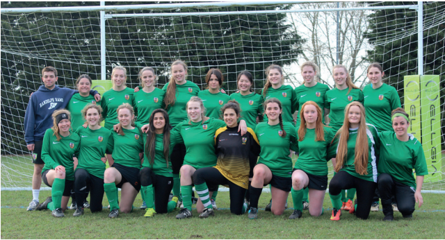
Women's football team – cuppers final - 2017