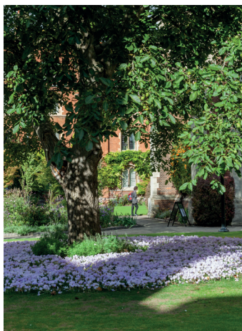
Autumn crocuses around the Walnut Tree