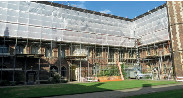
The replacement of the roof of the library side of Old Court