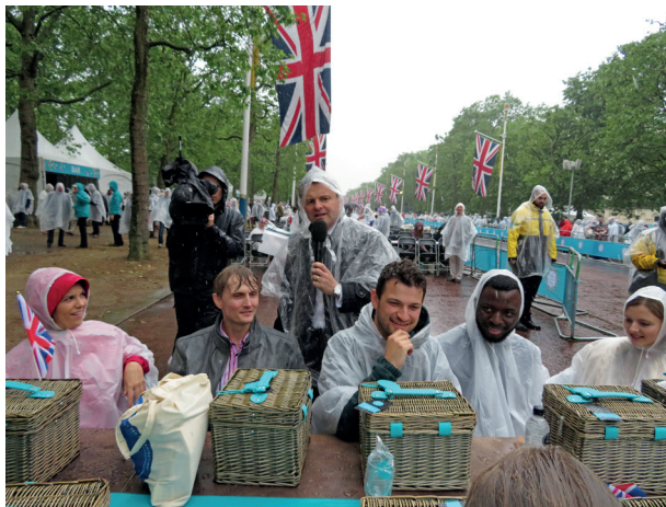
Enjoying the hampers at the open air lunch at the Mall for the Patroness's 90th birthday