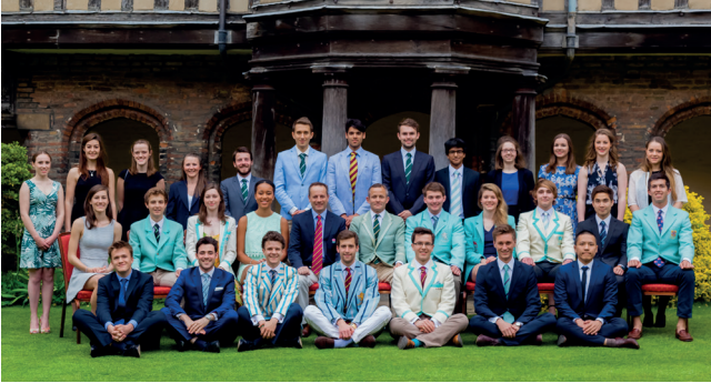
The Blues Dinner 2016