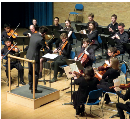
A Mag Soc Concert in West Road