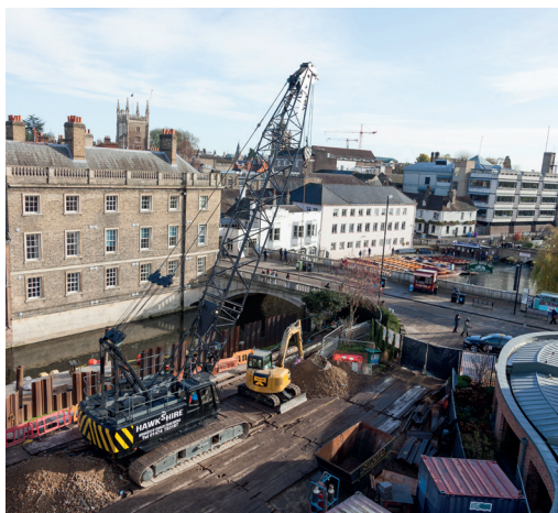
Repairing the river wall