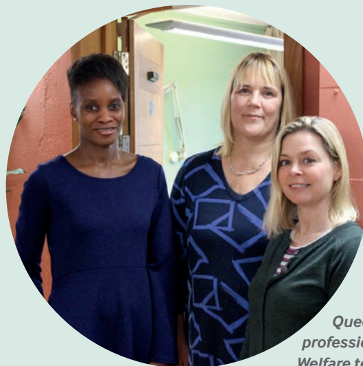
Queens' professional Welfare team

Students of PBS at Queens' study a wide range of modules, incorporating cognitive neuroscience, sociology, criminology, anthropology and beyond. PBS was only established as a separate Tripos subject in 2013, but it continues to grow in popularity and reputation at Queens'. This new subject fund will put it on an equal footing with other subjects such as Natural Sciences which already have an endowed subject fund. In helping students to pursue research projects, attend conferences and undertake placements, gifts to this fund will enable our students to reach their academic potential, as well as to go out into the world where they have a real impact on society and our understanding of human behaviour.