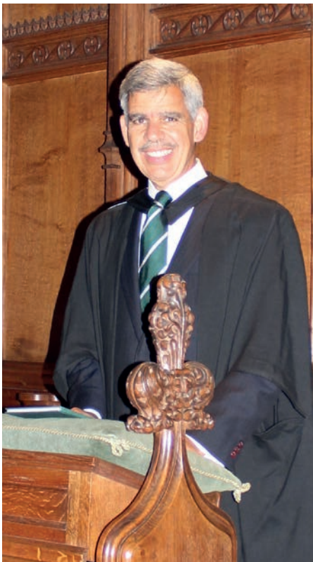
Floreat Domus is the motto of the College: 'May this house flourish.'