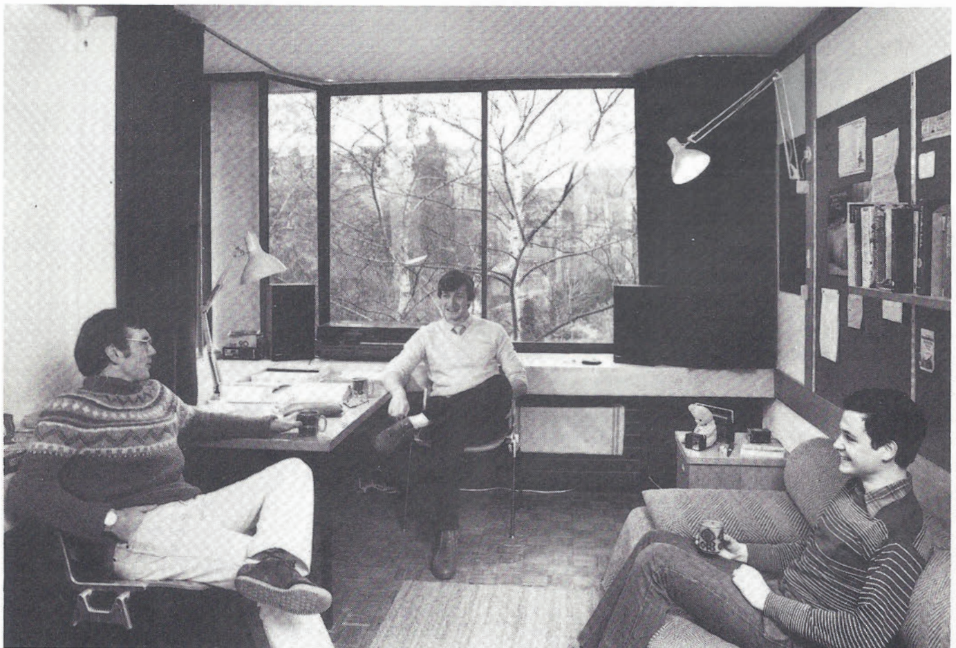
An undergraduate room in Cripps Court