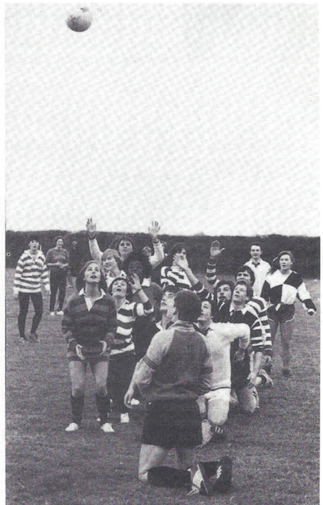
The men had to play on their knees

As is apparent, Q.C.R.F.C. is in a very healthy position and there are all the signs that the foundations have been laid for a successful run both in the Leagues and in Cuppers over the next few seasons.