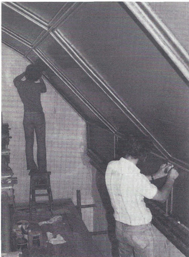
Applying gold leaf to roof of Library (Old Chapel)

The internal re-arrangements and restorations on I staircase have been completed. The set of the late Mr A. D. Browne is once again in occupation by a Fellow, and it is now possible to reach the Gallery of the Old Hall from the staircase without passing through the set. The floor of the Gallery itself has been relaid in three tiers to improve sightlines. It should have been recorded last year that the ancient dining tables from the Old Hall (excepting the High Table) have been restored and are now in use in the Armitage Dining Room in Cripps Court, while new folding-leg tables of high quality have been purchased for the Old Hall out of the College Development Appeal. These new tables enable the Old Hall more readily to be converted from dining to other uses and back again.