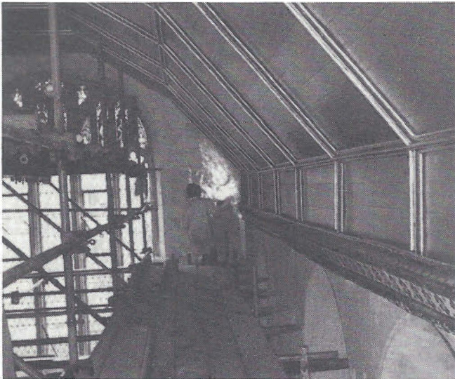
Priming east wall of Old Chapel

A major act of restoration this year has been the redecoration during the summer vacation 1981 of the War Memorial Library, which was the College Chapel until 1890. The boarded ceiling to this room had not been decorated since the mid-19th century. The old decorative scheme has been carefully renewed in paint and gold leaf. This important work was executed entirely by the College's own maintenance staff. Improved lighting has been installed.