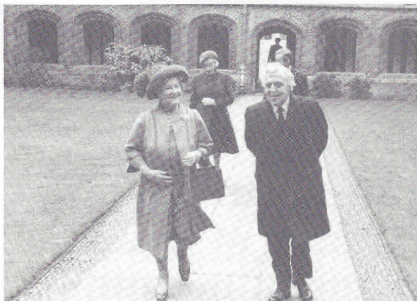
The Queen Mother visits the College on 28 January 1982