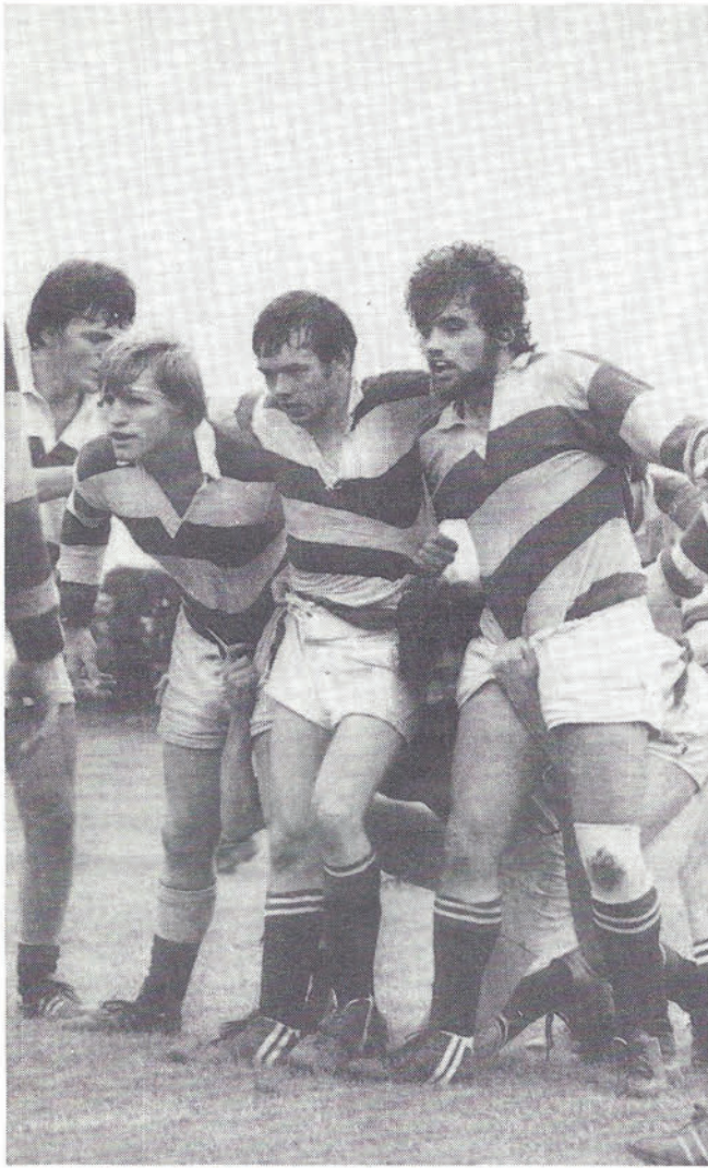
First XV scrum

'friendlies' have been organised which are played by an 'A' team consisting of a mixture of 1st, 2nd and 3rd team members. To date, the 'A' XV has played against the Girton team and Keble College, Oxford and is due to meet University College, Buckingham and Portsmouth Polytechnic this (Lent) term. A fixture versus an Addenbrooke's XV had unfortunately to be cancelled.