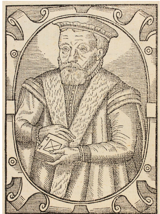
↑ Woodcut portrait of Thomas Smith from Gabriel Harvey, Smithus; vel Musarum lachrymae (London, 1578) [G.15.5(1)].

← The notes and icons Smith entered into his books are hugely revealing. This derogatory reference reflects his general view of women whose company is said to have brought him only 'sorrow and anxiety'.