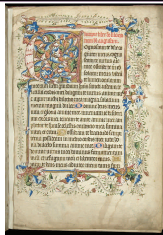
Queens' MS 25. St Augustine's Soliloquia. 15th-century manuscript once owned by Mary Tudor. Find out more