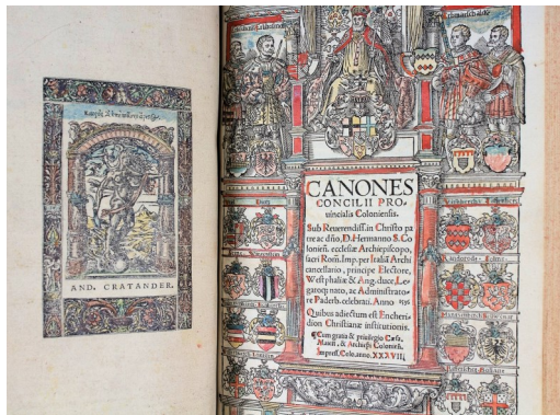
▲ Hand-coloured printer's device and woodcut border in this 1538 edition of the provincial synod of the Archbishopric of Cologne from 1536 [F.3.21(2)]

Cryptic signs, messages, and poems include a mischievous nun/friar poem scrawled onto a magnificent 15th-century bible, a 17th-century laundry list, as well as mnemonic diagrams and hand-coloured decorations all of which record in unique ways the lives of early modern readers and the relationships they formed with the books they used (and misused!)